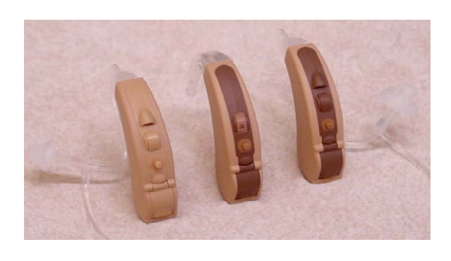
LIBERTY CONVERTIBLE OTE/BTE