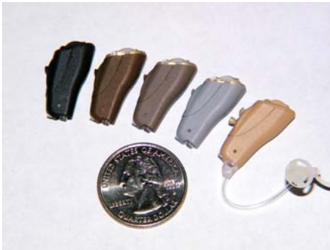
FREEDOM 4 OPEN FIT MINI-OTE (Over the Ear)